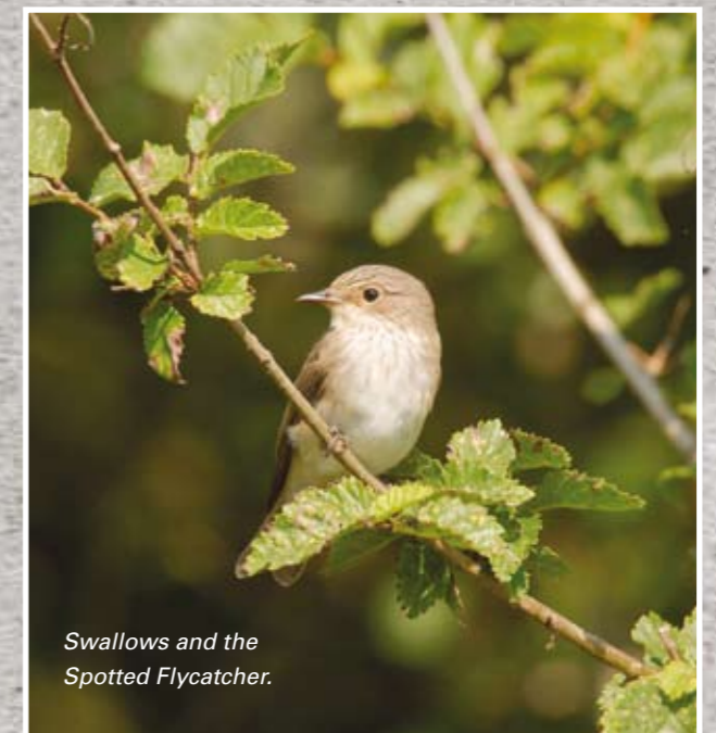
Swallows and the Spotted Flycatcher.

The second species for which the word exotic is often used is the Golden Oriole, which tends to arrive a few weeks later than the Hoopoe in late April and May. As was noted with the Hoopoe, it can also be seen in autumn in some years, but is best thought of as one of Scilly's spring specialities. The birdwatcher looking for a Golden Oriole will be listening to the call that is often described as 'cat-like'. It is not an analogy I like as it sounds more like a weak version of the call of a Jay to me, the latter a species not recorded on Scilly for some time. It is the song of the Golden Oriole that is heard in the more wooded areas of Scilly from the Abbey Woods on Treco to the Nature Trails on St Mary's. This melodious fluting song is usually heard at dawn with occasional snatches later in the day. When heard